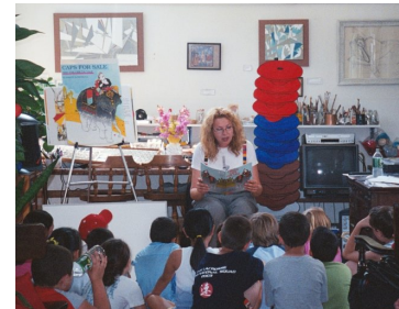
Reading at the Slobodkina Foundation House 2006

And by the way, every tree, chair, lamp, building, cap and, of course, monkey, was produced using Esphyr's original art. By way of example, although most of the images were scanned from Caps for Sale illustrations, the Peddler's bed and some of the people were extracted from Circus Caps for Sale , the house from Jack and Jim , furniture from Moving day for the Middleman's , and the banana from Esphyr's oil painting Still Life with Fruit .